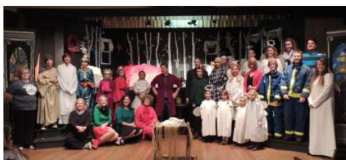
The Best Christmas Pageant Ever