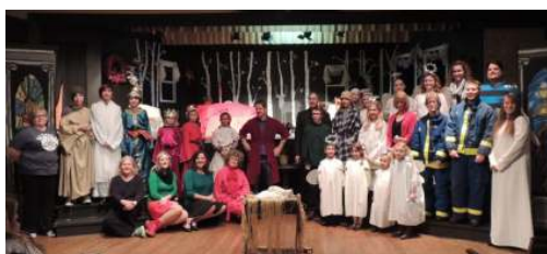
The Best Christmas Pageant Ever