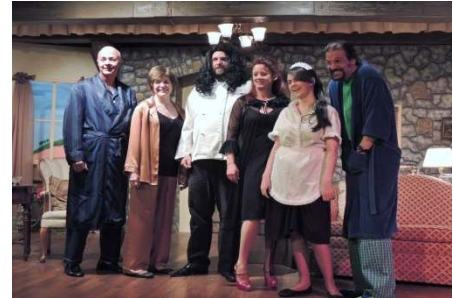
Don't Dress for Dinner

Brevard Little Theatre is the Official Community Theatre of Transylvania County & Brevard