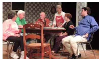
Over the River and Through the Woods