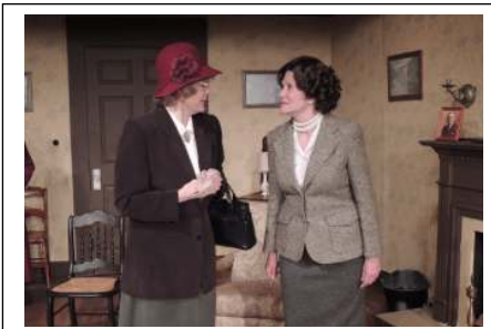
A Murder is Announced