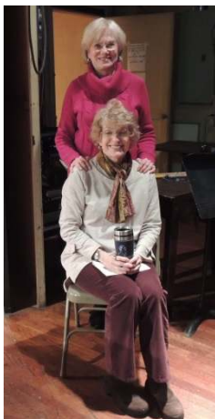
Whitmore & O'Hare