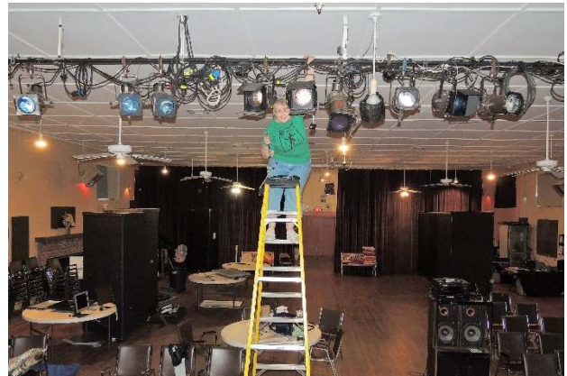
Pat Durako adjusts the light prior to production. Those with acrophobia need not apply!

Pat would love to share her knowledge and experience with anyone who is interested in learning to operate the light board or spotlight, hang lights, focus lights and/or work with cables and wiring.