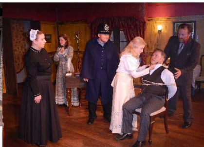
Angel Street (April)