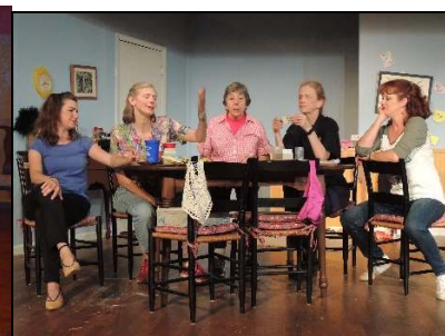
The Odd Couple: Female Version (June)