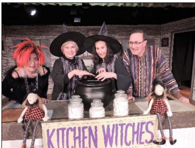
The Kitchen Witches (February)

In the near future, we'll be sending out the brochures for our 2017 season. I'm confident you will like what you see on our new schedule. We look forward to seeing you here at BLT.